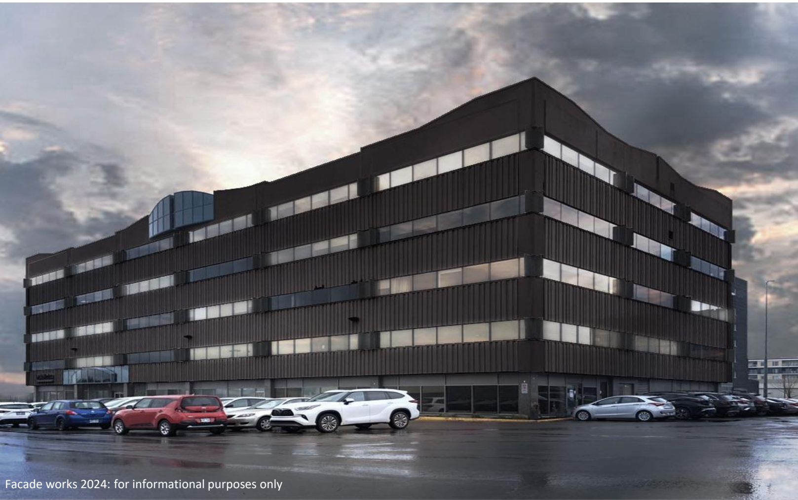
Facade works 2024: for informational purposes only